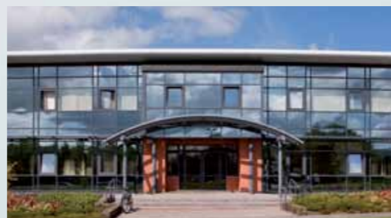
Tom Crean Business Centre – Kerry Technology Park